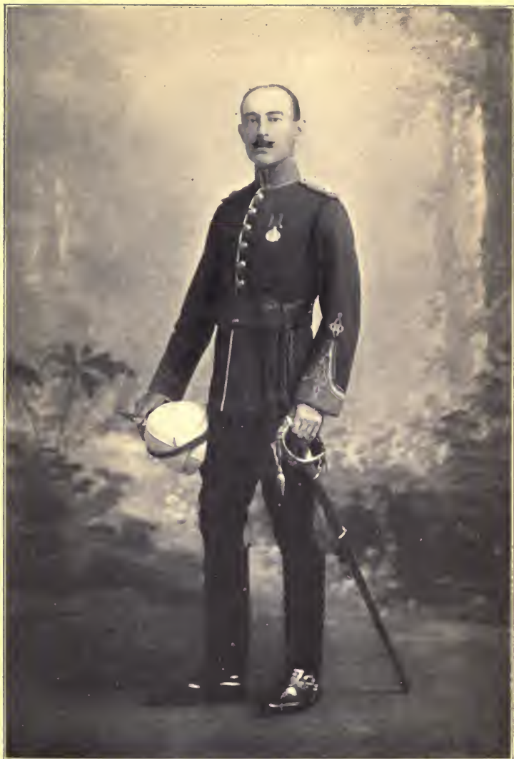
AFTER THE PROCLAMATION PARADE.